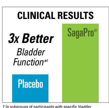
† In subgroups of participants with specific bladder and urination characteristics

Participants in a recent clinical trial experienced support for healthy bladder function, and reported improved sleep patterns as well.**